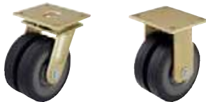
Swivel castors Fixed castors

Brackets: LSD/BSL Series - Very rugged welded steel construction, swivel bracket with axial grooved ball bearing DIN 711 and tapered roller bearing DIN 720 in the swivel head, dust and splash-proof. Fitted grease nipple, welded very strong, bolted and secured central kingpin, bolted wheel axle. Wheel Ø 160+200 mm: Zinc-plated - yellow passivated. Wheel Ø 250+300 mm: Lacquered - colour red. Top plate drawings: Page 72. Detailed description: Page 64.