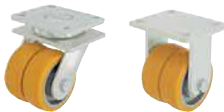
Swivel castors Fixed castors

Brackets: LOD/BOD Series - Heavy welded steel construction, swivel bracket with double ball bearing in the swivel head, additionally reinforced by the integration of four specially shaped and hardened bearing seats , labyrinth swivel head sealing with grease nipple, welded very strong, bolted and secured central kingpin, bolted wheel axle, zinc-plated.