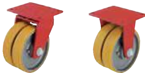
Swivel castors Fixed castors

Brackets: LSD/BSL Series - Very rugged welded steel construction, swivel bracket with axial grooved ball bearing DIN 711 and tapered roller bearing DIN 720 in the swivel head, dust and splash water-proof. Fitted grease nipple, welded very strong, bolted and secured central kingpin, bolted wheel axle. Up to Ref. No. LSD-GTH 200K-35: Zinc-plated - yellow passivated, as of Ref. No. LSD-GTH 202K: Lacquered - colour red. Top plate drawings: Page 72. Detailed description: Page 64.