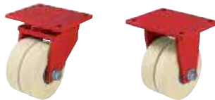
Swivel castors Fixed castors

Brackets: LSD/BSL Series - Very rugged welded steel construction, swivel bracket with axial grooved ball bearing DIN 711 and tapered roller bearing DIN 720 in the swivel head, dust and splash water-proof. Fitted grease nipple, welded very strong, bolted and secured central kingpin, bolted wheel axle. Wheel Ø 80+100 mm: Zinc-plated - yellow passivated. Wheel Ø 125 - 400 mm: Lacquered - colour red. Top plate drawings: Page 71 and 72. Detailed description: Page 64.