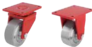
Swivel castors Fixed castors

Brackets: LS/BS Series - Very rugged welded steel construction, swivel bracket with axial grooved ball bearing DIN 711 and tapered roller bearing DIN 720 in the swivel head, dust and splash-proof. Fitted grease nipple, welded very strong, bolted and secured central kingpin, bolted wheel axle, Wheel dimensions 100x40 - 200x55 mm: Zinc-plated - yellow passivated, wheel dimensions 200x80 - 250x65 mm: Lacquered - colour red. Top plate drawings: Page 71 and 72. Detailed description: Page 64.