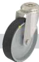
Antistatic version, non-marking grey